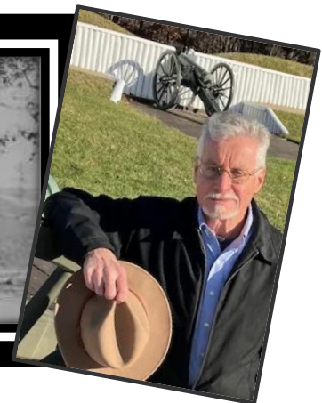
15th N.Y. Heavy Artillery, Fort Woodbury, VA

In early 1864, many heavy artillery regiments in the Civil War were garrisoning the Washington defenses, including the 15 th New York. At the same time, general in chief Ulysses S. Grant sought to replenish the ranks of the Army of the Potomac, and the 15 th became one of the first outfits dispatched to Major General Meade at Brandy Station.